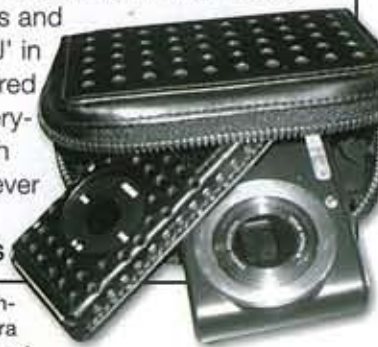
His matching camera and iPod set