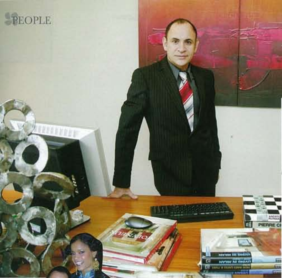
OJ with Blue Cantral

Have you ever asked yourself who in your life is it that matters to you the most? Who are the people you can't live without, the people that keep you sane? What if we told you to choose only five? Who would they be? Excluding your immediate family, that is!